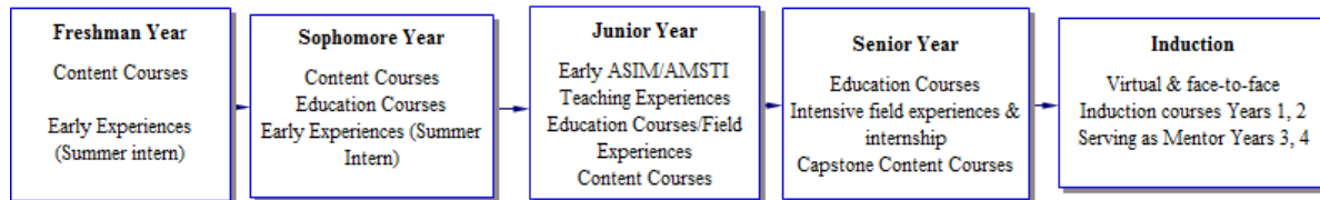
Figure 2: UA Noyce Teacher Preparation Program Sequence

The UA-Noyce Scholarship/Stipend provides support for students seeking certification at the undergraduate, junior and senior years, or Master's degree level to teach secondary school chemistry, physics, or mathematics. For undergraduate majors seeking certification in the target disciplines, the award consists of a maximum of $16,000 a year during the junior and senior years. For students with an undergraduate major in the target disciplines enrolled in the UA Master's degree Alternative Certification (MA Alt Cert) program, the award consists of a maximum of $17,000 a year for up to one year of study. Care will be taken to select students from each of the target majors each year. Four or more awards are anticipated to be available each year of the program. Awards typically will be made in November and March for the following spring or fall semester.